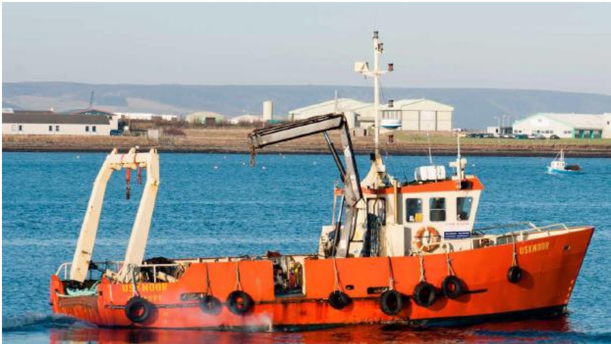
Figure 1 – Uskmoor

The Construction Vessel the Uskmoor will be involved in these operations.