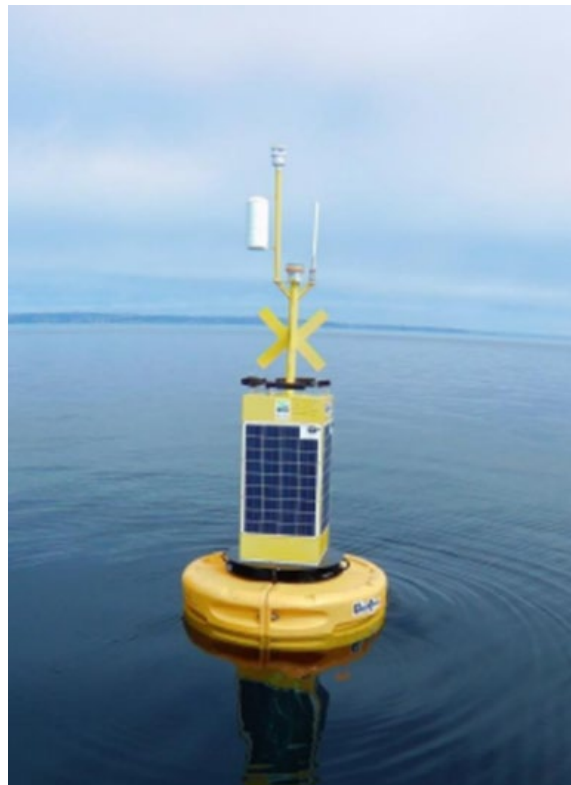
Figure 2 OSIL Fulmar Data Buoy

The coordinates of the met-ocean buoy are presented in Table 1.