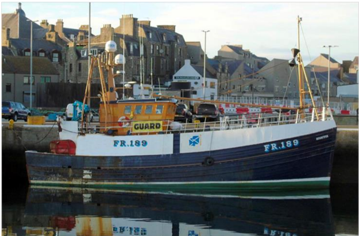
Figure 2: .Survey vessel Bountiful